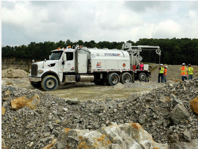
ΔE2 integrates into any Differential Energy bulk emulsion truck and improves operator efficiency by simplifying the loading process.

The history of the system dates back to the 1990s “when our bulk loading technology advanced enough to allow ways to load different product types in the same borehole,” Lamont said.